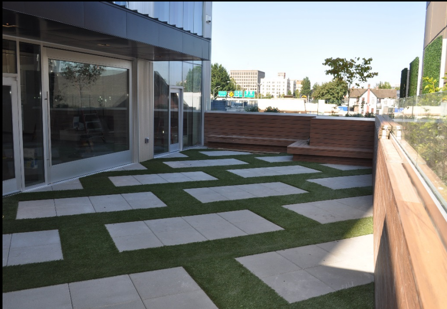
Pavers and turf complete at North Terrace