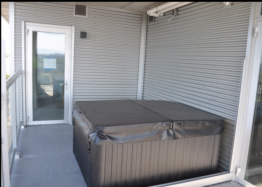
Hot tub installed at level 11 terrace