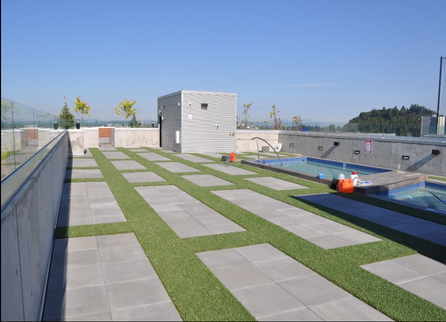
Pavers and turf complete on rooftop