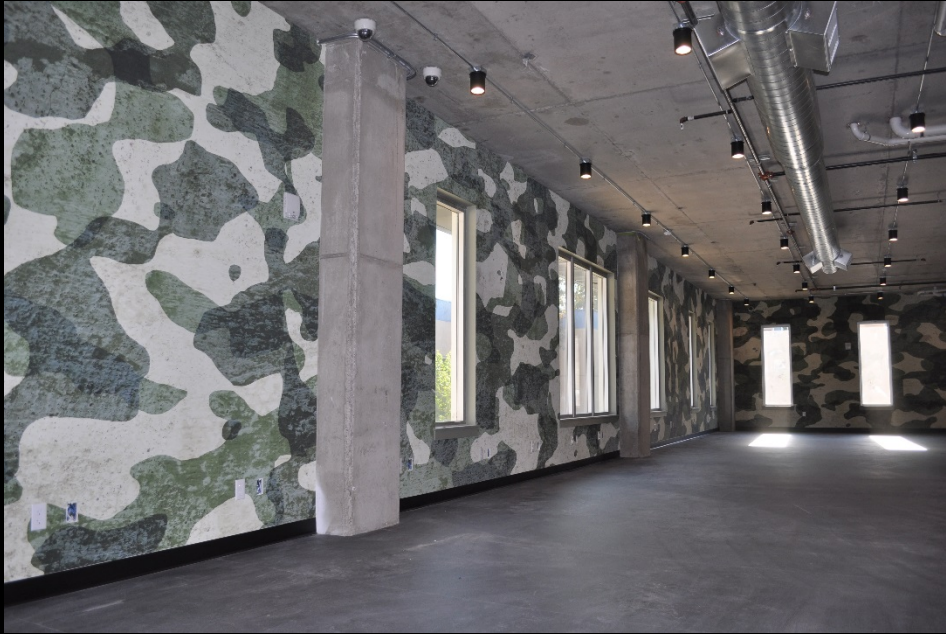
Wallcovering installed at Fitness Area