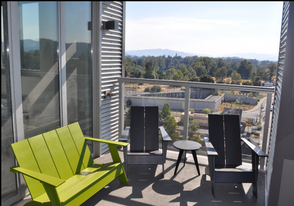
Furniture installed at level 11 terrace