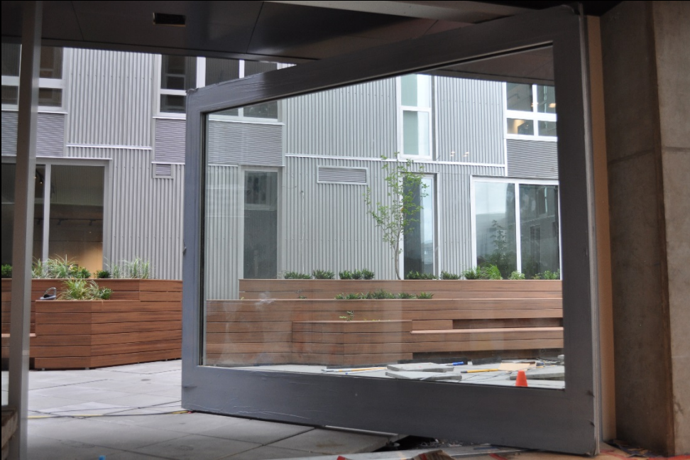
Pivot door installation complete at Club Room