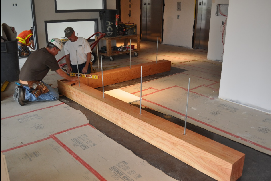
Reception desk installation at Leasing Lobby