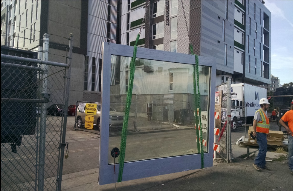
Hoisting Club Room pivot doors into the building