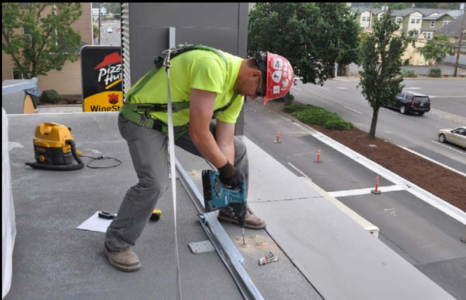
Glass railing installation at level 3 terrace