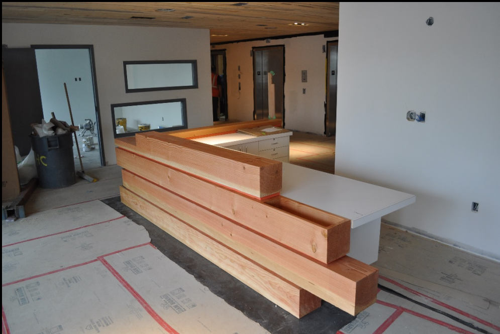
Reception desk installed at Leasing Lobby