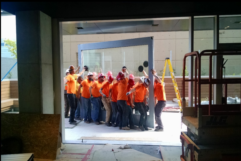
An army of installers lift the pivot doors into place at the Club Room.