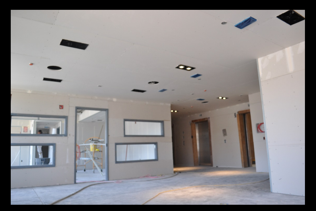
Drywall installed at 1<sup>st</sup> floor Leasing