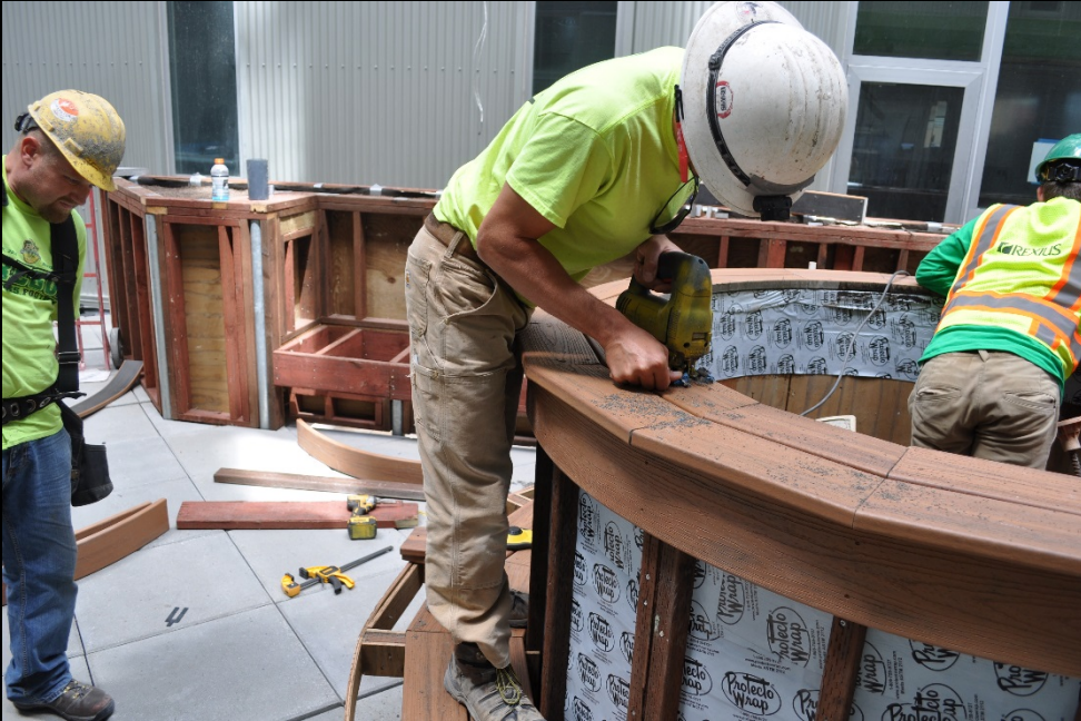
Trex installation at radius tree bench in Courtyard