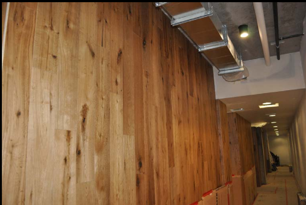
Completed wood plank walls at level 2 amenities corridor