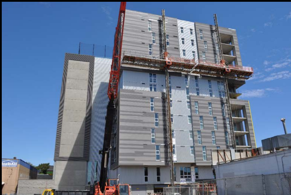
Metal panels nearly complete at West elevation