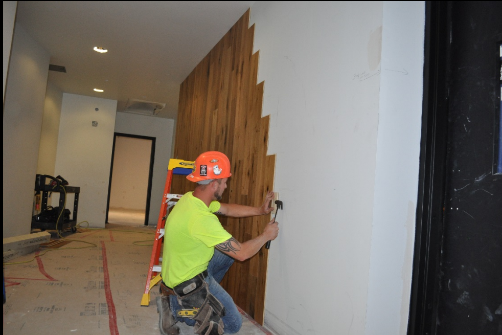
Wood plank walls at level 2 amenities corridor