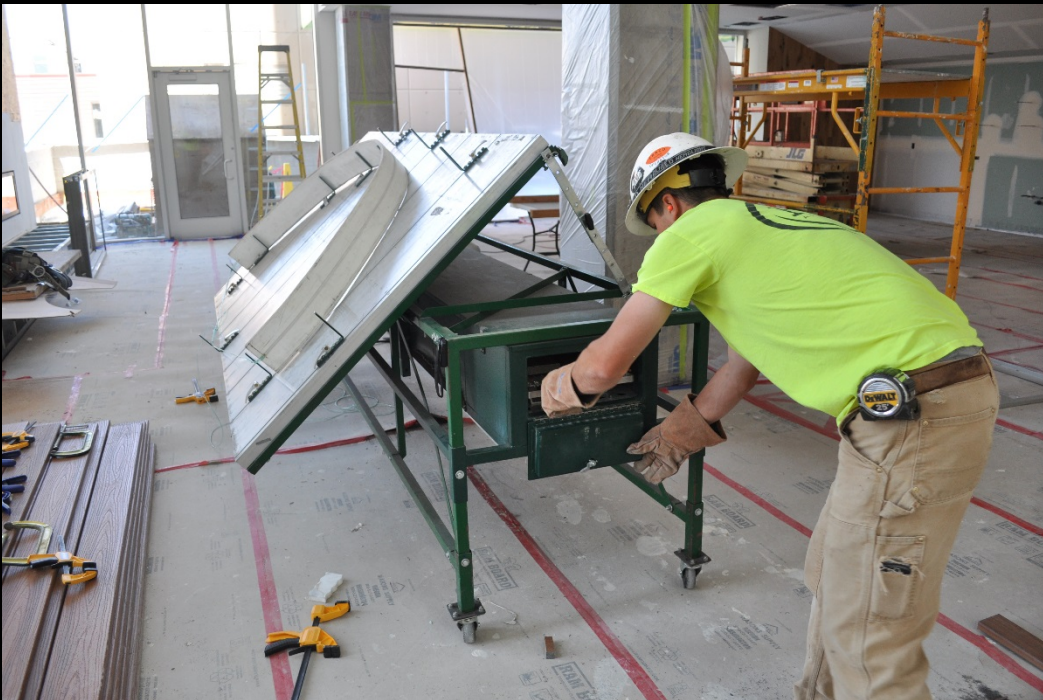
Heating up Trex decking for radius bending