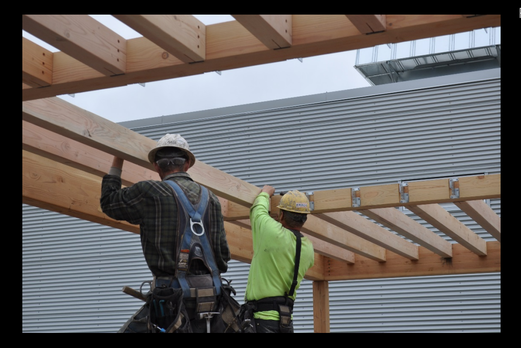
Rooftop trellis framing