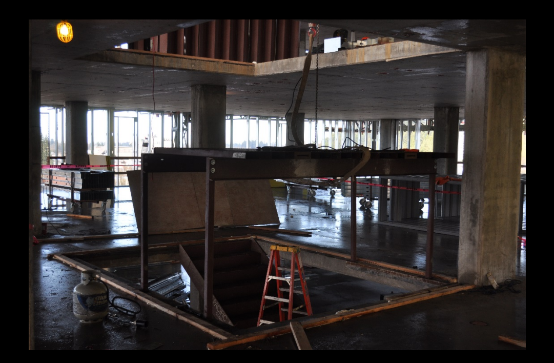
Stair 1 installation on 11<sup>th</sup> floor