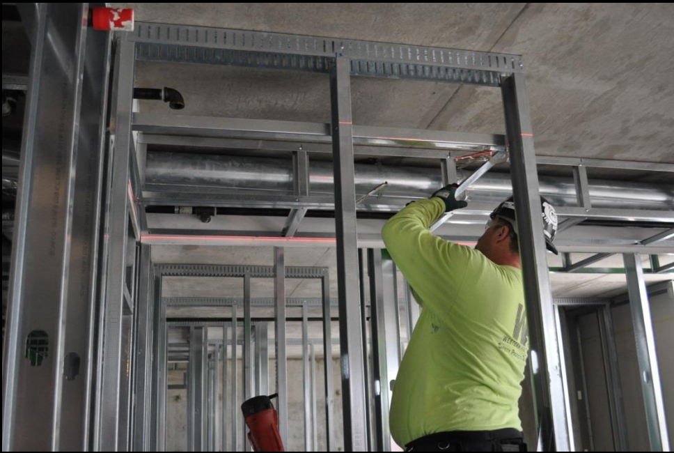
level 6 ceiling framing duct installation