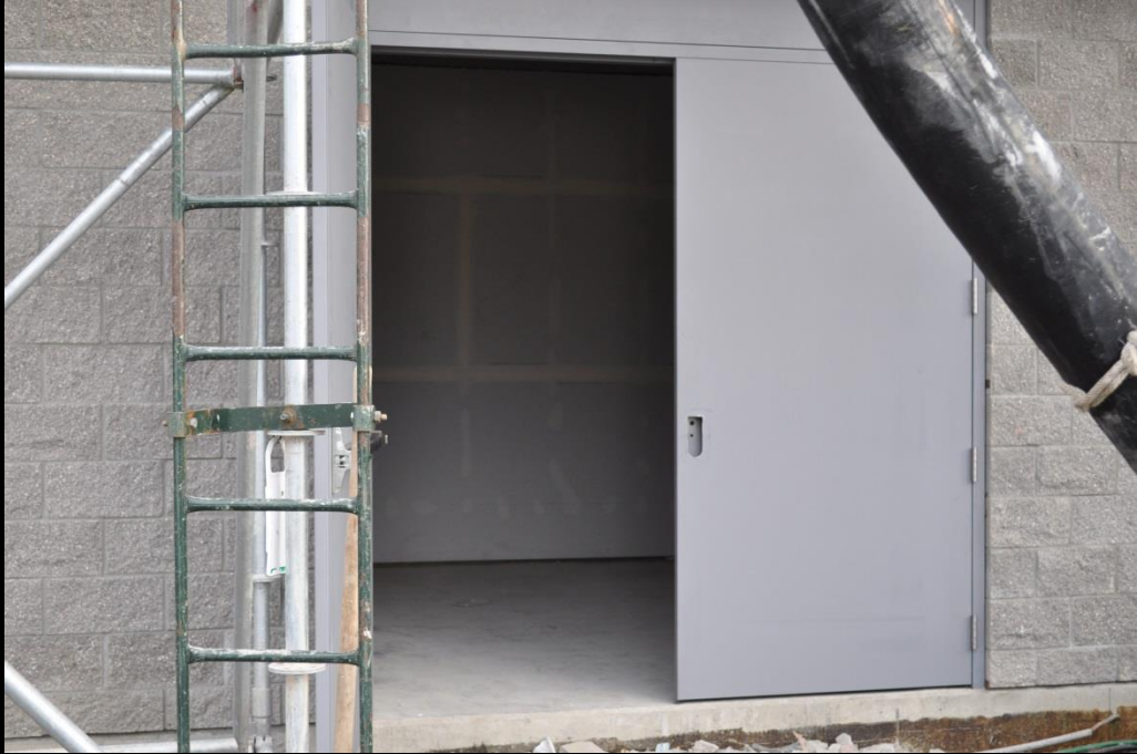
transformer room level 1 west side of building