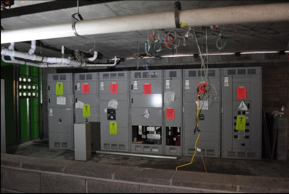
Main electrical gear installation