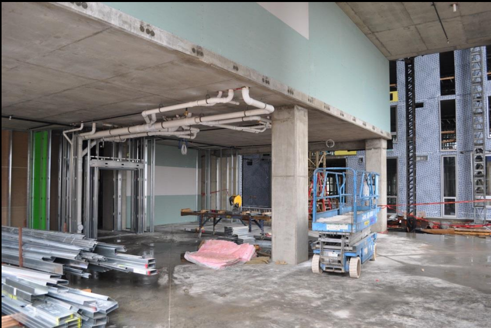
club room view to the south