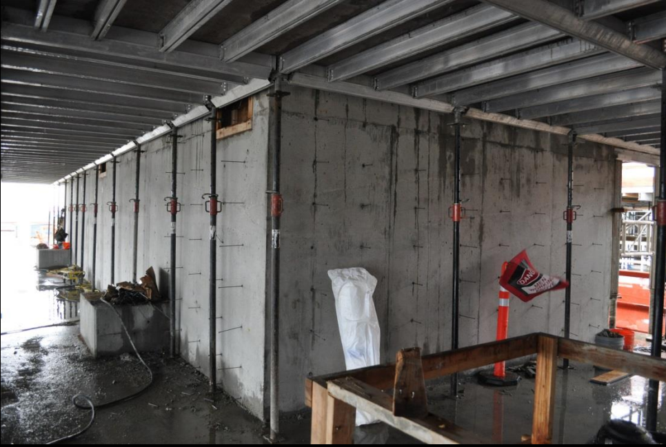
level 12 swimming pool walls