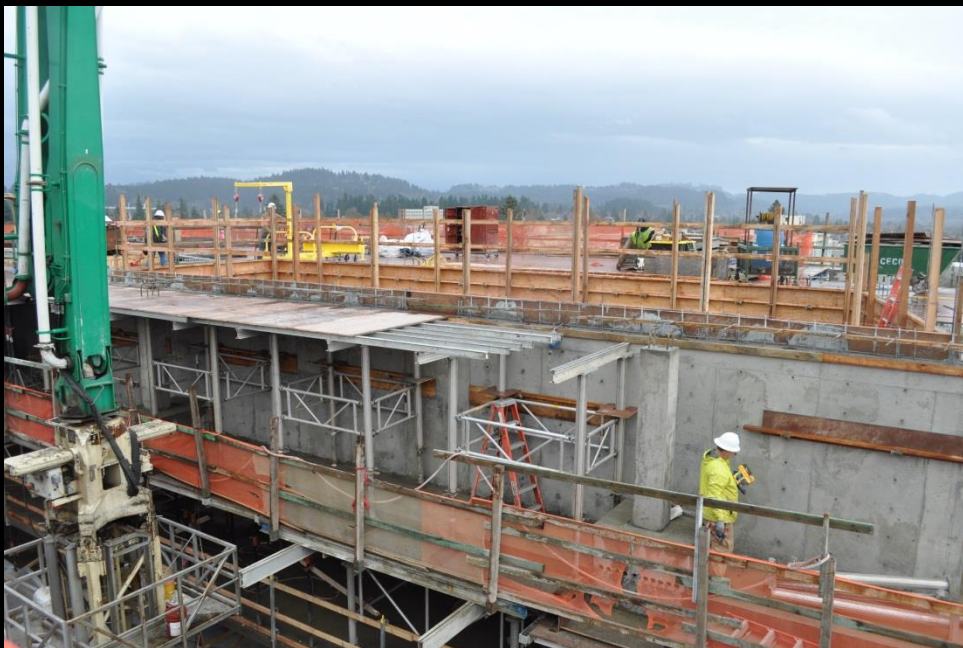
roof deck north side of the courtyard view to the south of the pool area