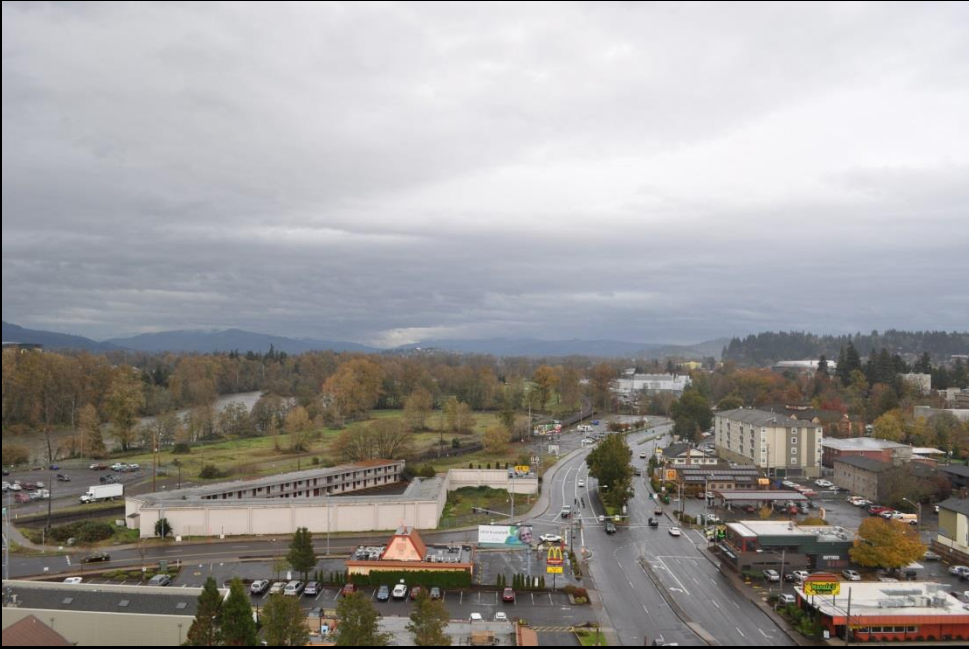
Roof view to the east