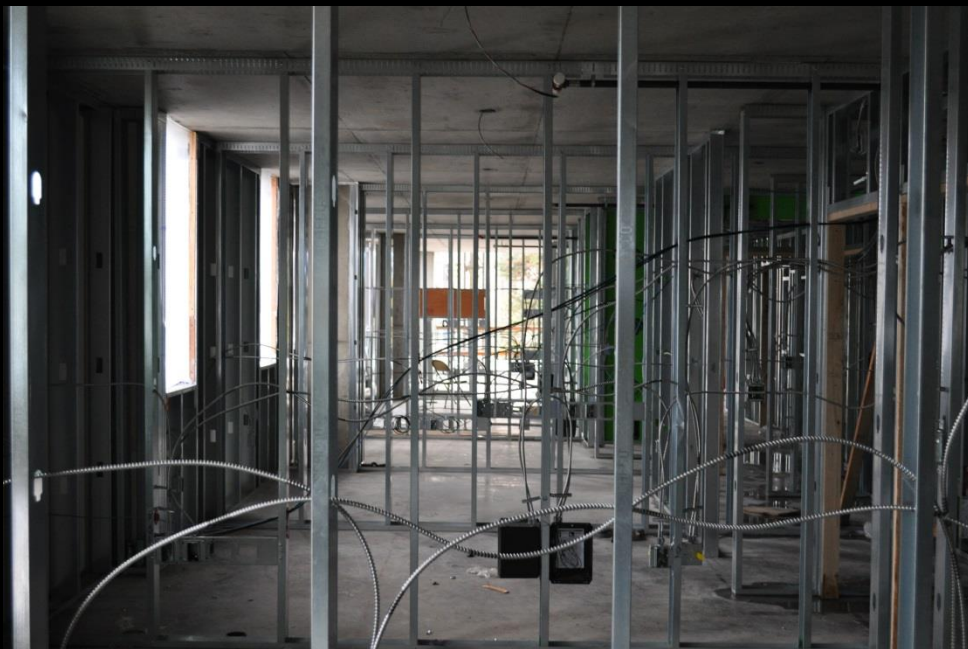
level 5 rough in