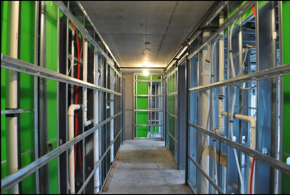
level 4 corridor