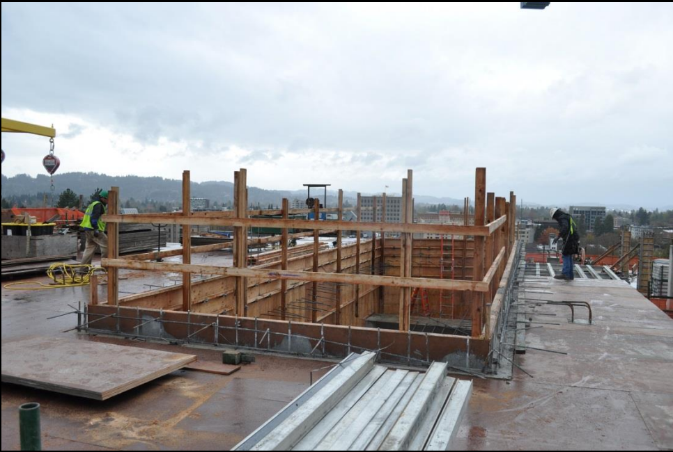
roof deck east side of the pool view to the west into the pool.