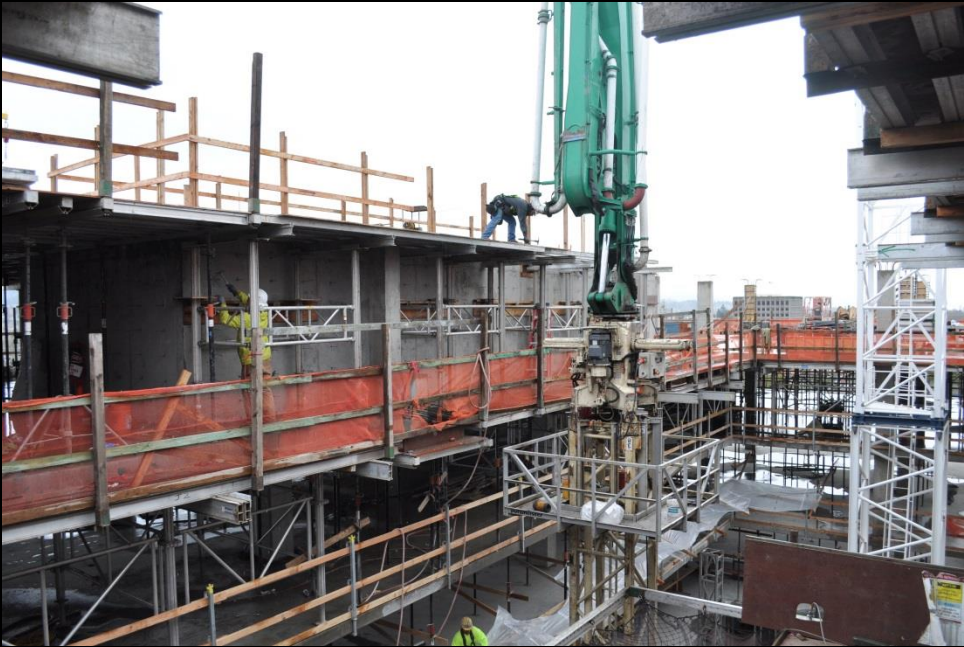
level 12 standing at the north east corner of the courtyard view to the south west