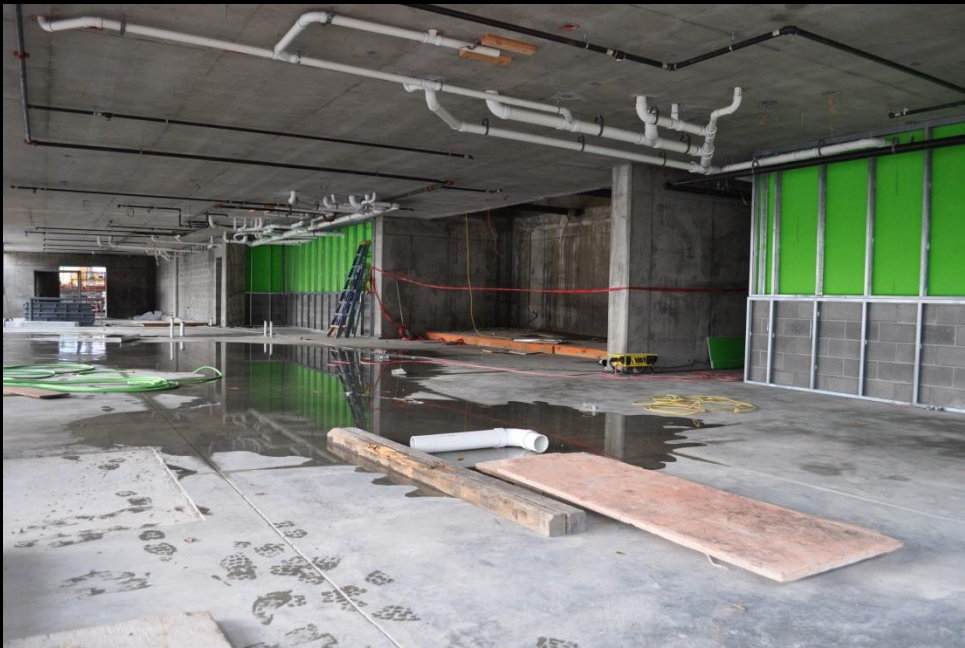
level 1 south east corner of the building view to the north west elevator shaft in the center.