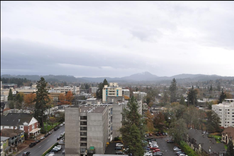
Roof view to the south