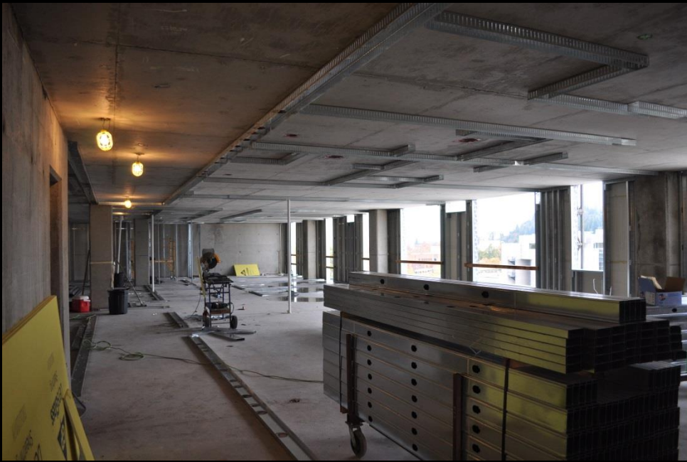
Level 7 north side of the building view to the west interior framing underway.