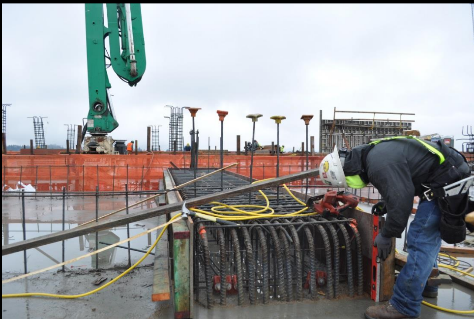
level 12 pool support beam formwork and reinforcement