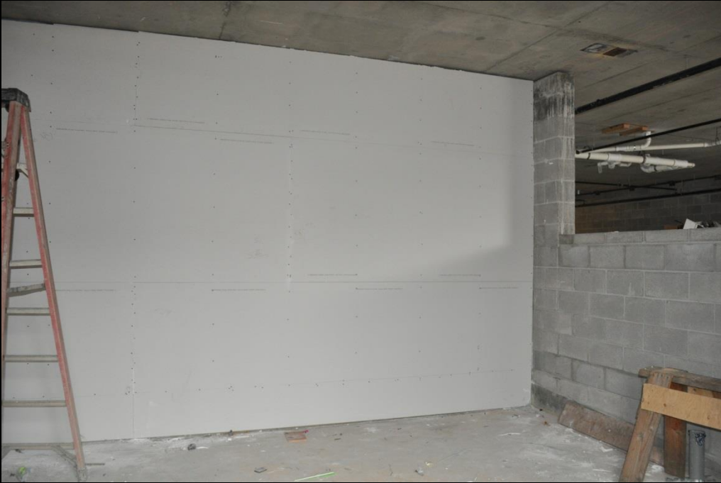
level 1 transformer room.