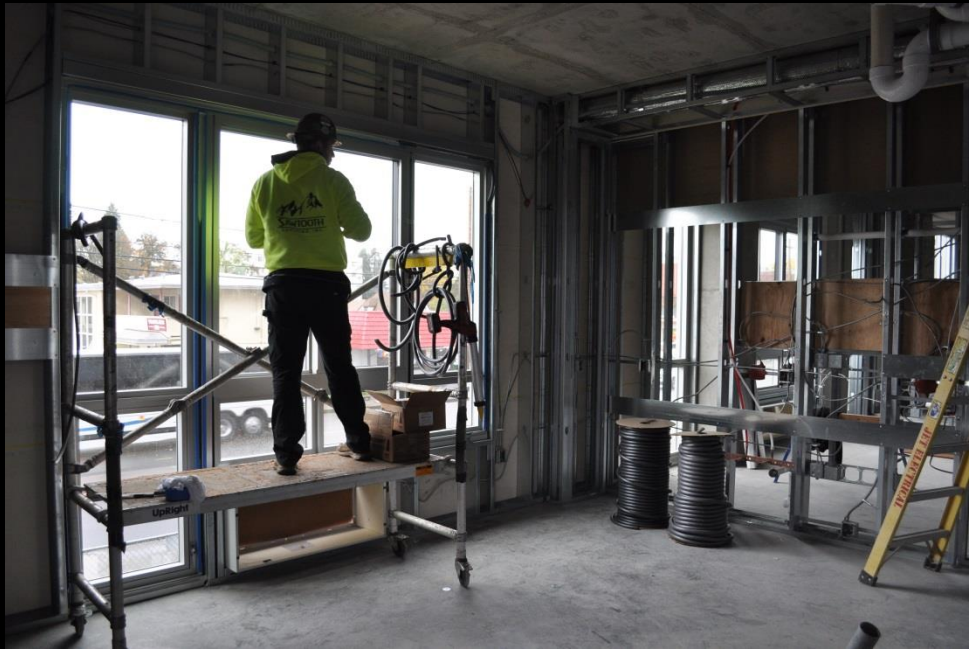
Window caulking level 3