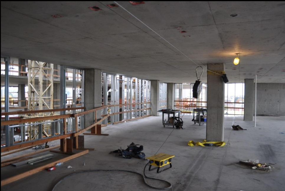
Level 8 north side of the building looking west exterior framing underway.