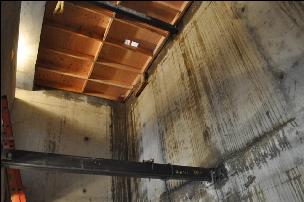
Elevator shaft steel installation level 5