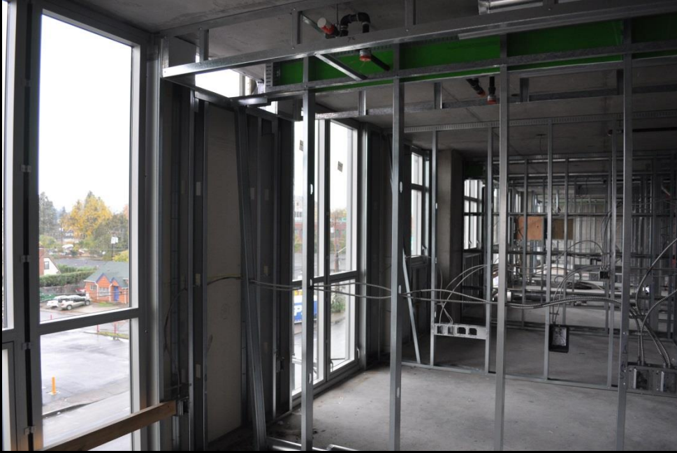
rough in level 5