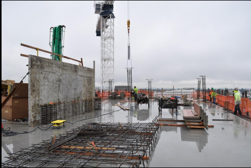
Level 12 north east corner looking west. Installing column reinforcement.