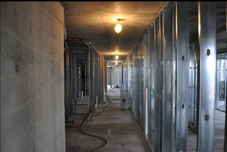
Level 6 east side of elevator looking north