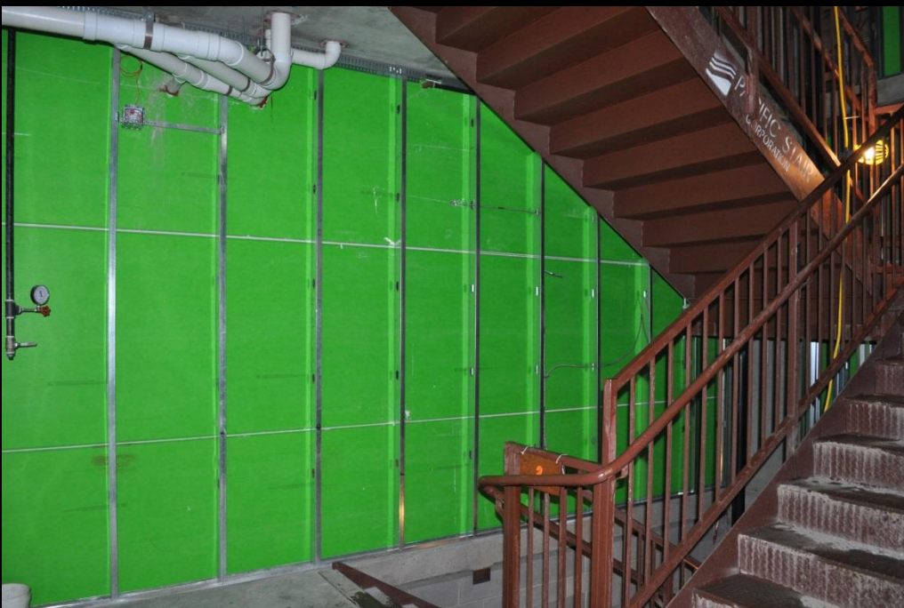
level 2 stair 1.